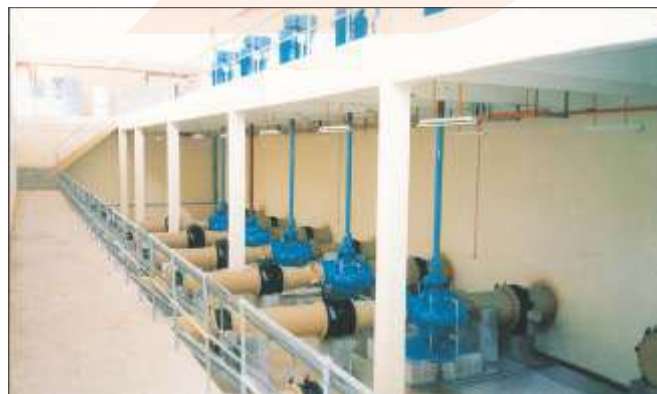
Axially-splitcase pumps in vertical execution, for a water supply scheme in Kedah, Malaysia.