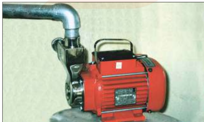
A Monobloc Pump in Stainless Steel Construction in Use for Domestic Water Supply