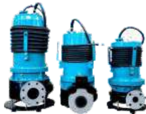
Non-clog Submersible Pump