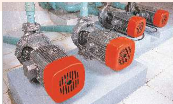
Monobloc Pump in Use for Water Supply at a Site in India