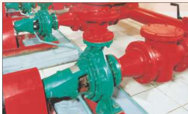
DB pumps for firefighting application