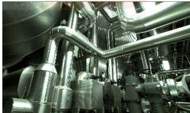
Chemical & process plant