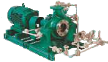
End Suction Process Pump