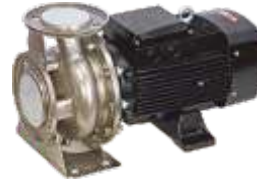
Stainless Steel Monobloc Pump Type - KSMB