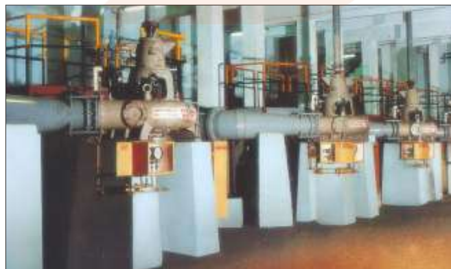
Sewage handling pumps installed at a site in Versova, Maharashtra, India