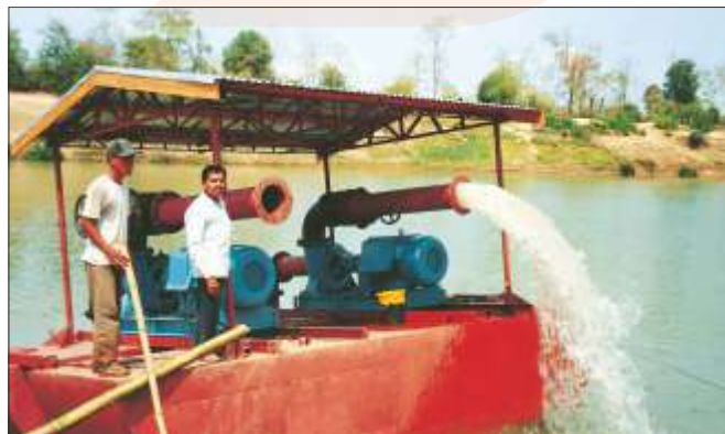
Pontoon mounted mixed flow pumpsets for irrigating paddy fields along Mekong river, the lifeline of Lao PDR