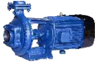
Monobloc Pumps Three Phase Type - KDS