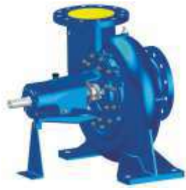
End Suction Pump