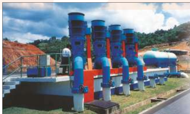
Vertical Turbine (VT) Pumpsets in operation for water supply scheme at Sabah, East Malaysia.