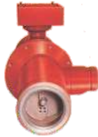
Canned Motor Pump