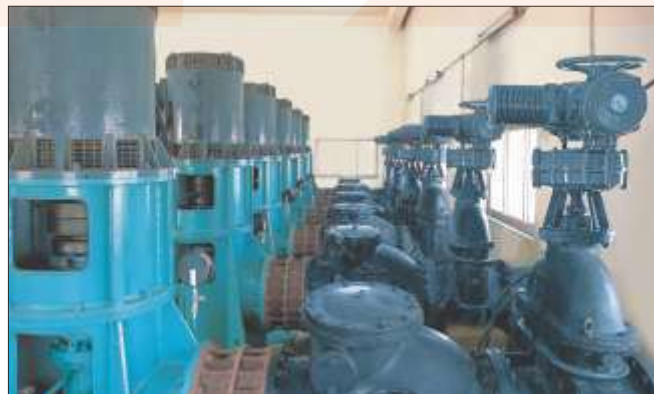
Sluice and reflux valves installed at a Metro Municipal Corporation in India