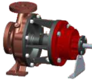
Air cooled Thermic Fluid Pump Type - AT