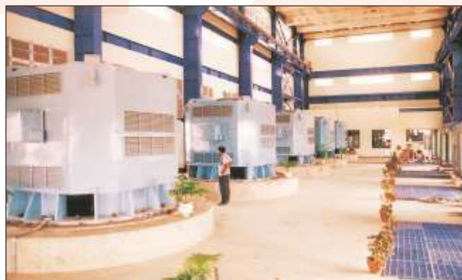
Concrete Volute Pumps (CVP) installed at the National Thermal Power Corporation, Vindhyachal, India