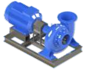
Mixed Flow Pump