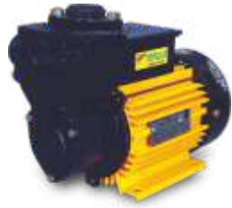
Domestic Monobloc Pump Type - MINI