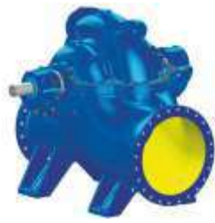
Horizontal Axially Split Casing Single Stage Pump