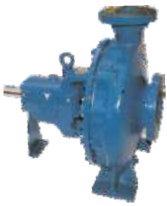
End Suction Pump