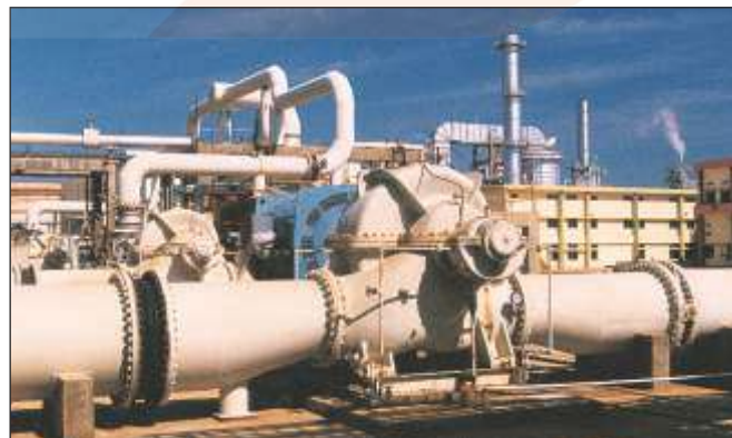
Horizontal splitcase pump installed at a Chemical plant in Kochi, India