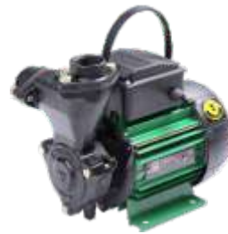
Self-priming Pump Ultra Series Type - Star Ultra