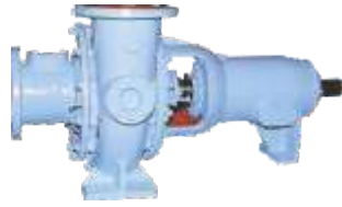
Solids Handling Non-clog Pump