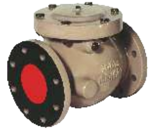
Check Valve (Cast Steel)