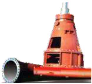
Metallic Volute Pump