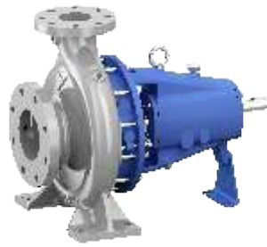
End Suction Centrifugal Process Pump Type - GK(P)