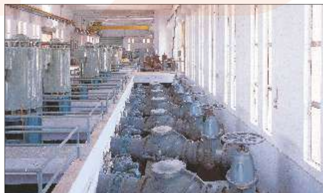
Valves with pumps installed at Maharashtra Industrial Development Corporation Water Supply Project, Mumbai, India