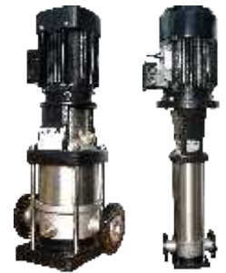
In-line Vertical Multistage Pump