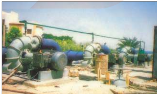
Mixed flow pumps for sewage application at Faiyad, Egypt