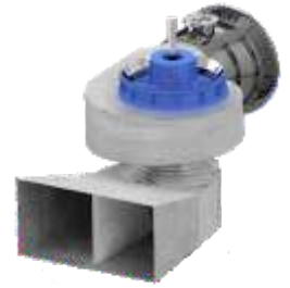
Concrete Volute Pump