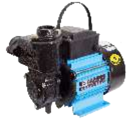
Self Priming Pump Sparkle Series Type - Sparkle