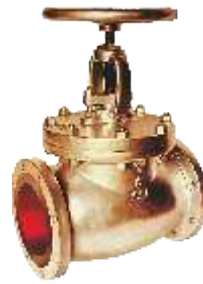
Globe Valve (Cast Steel)