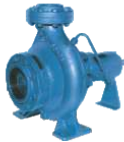
End Suction Pump