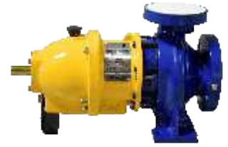
Magnetic Drive Pump Type - ROMA K