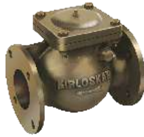
Reflux Valve (Non-Return Valve)