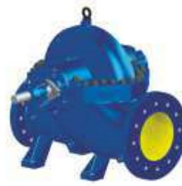
Horizontal Axially Split Casing Pump