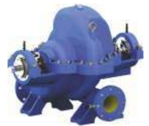
Horizontal Axially Split Casing Two Stage Pump