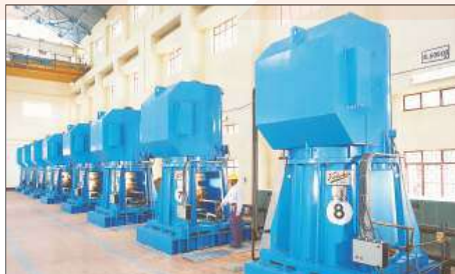
Vertical Turbine (VT) Pumps installed at Takari II Stage Irrigation Project, Maharashtra, India