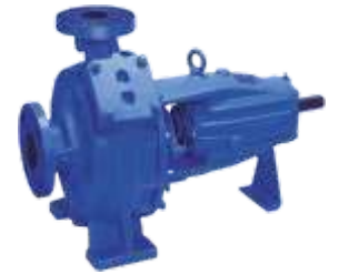
Solids Handling Pump