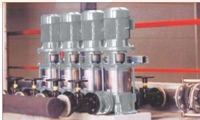
Vertical multi-stage pressed stainless steel inline Pumps installed at a site