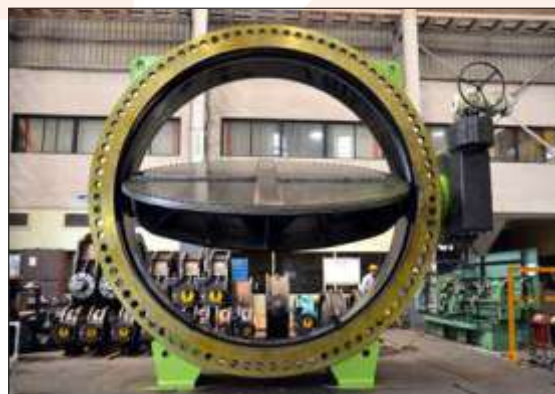
The largest butterfly valve (3800 mm) in thermal power plants in India